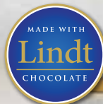
Swiss Milk Chocolate Truffle Cake made with Lindt Serves 10-12 | 8"

E nsure your party has a sweet ending with decadent cakes. Offer a flavourful mix of options on your dessert table, from mild cocoa & intensely chocolate to warm spice & mellow sweetness. We can also help you create the perfect cake/cupcakes (or more) to delight every occasion.