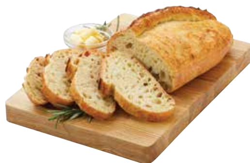
Front Street Bakery Rustic Country Bread 500 G