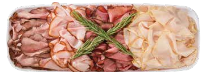
Artisanal Meat Platter Serves 12