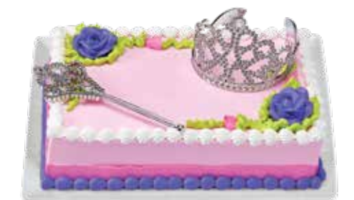
Build a Cake Choose your cake (size & filling), icing, ornaments (over 20 varieties: Super Mario, Disney Princesses, Spiderman, etc.)