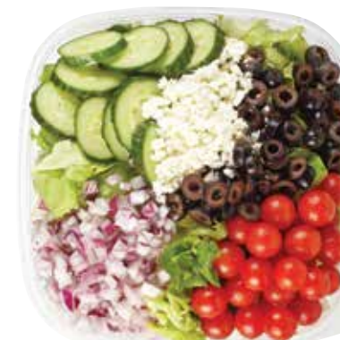
Family Size Salad Choose from: Caesar, Greek or Garden Serves 3-5