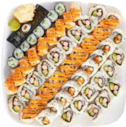
Kazoku Platter 53 Pieces | Serves 6

*Available in sushi chef locations only.