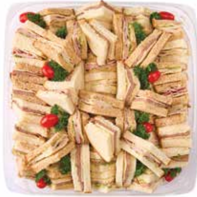
Deluxe Sandwich Platter Serves 12