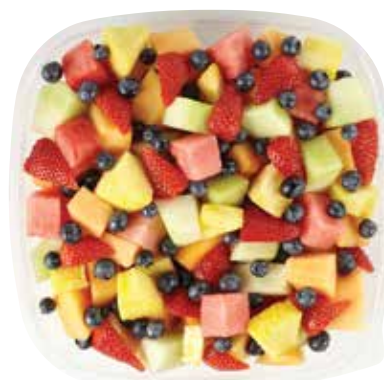
Party Size Deluxe Fruit Salad Serves 6-8

Maintain freshness: Keep trays in the fridge just before serving.