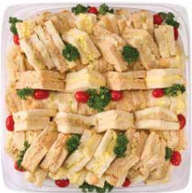
Finger Sandwich Platter Serves 12