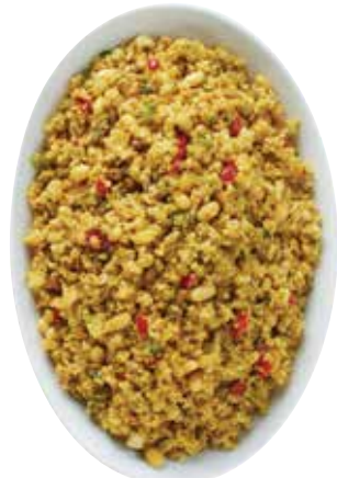
Seven Grain Salad Serves 6-8