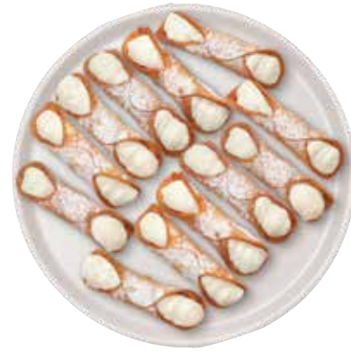
Front Street Bakery Cannoli Platter 12 Pieces