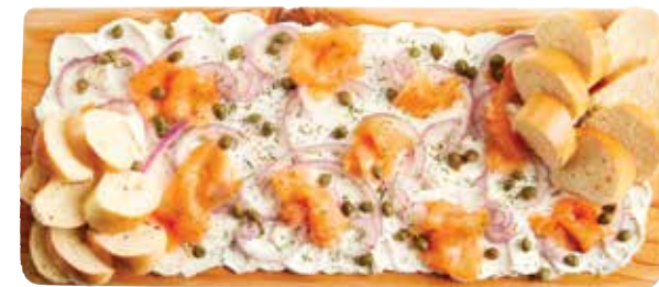
Smoked Salmon Board Serves 6