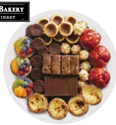
Front Street Bakery Ultimate Dessert Platter 48 Pieces