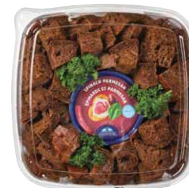
Pumpernickel Tray with Dip Serves 10