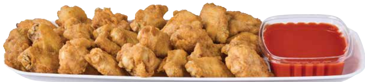
Chicken Wings Serves 12