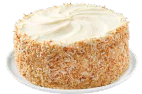
Carrot Cake Serves 10-12 | 8"