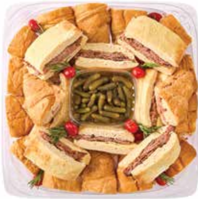
The Entertainer Platter Serves 12