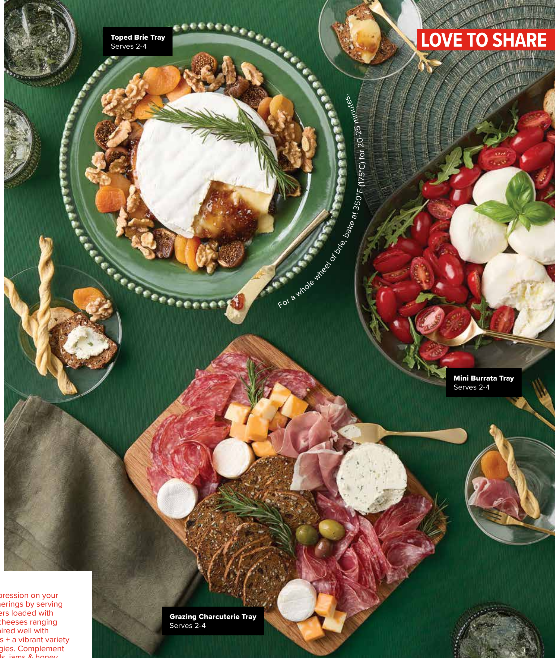
Topped Brie Tray Serves 2-4

M ake a big impression on your intimate gatherings by serving smaller platters loaded with favourites, such as cheeses ranging from soft to hard; paired well with savoury cured meats + a vibrant variety of fresh fruits & veggies. Complement with crackers, breads, jams & honey.