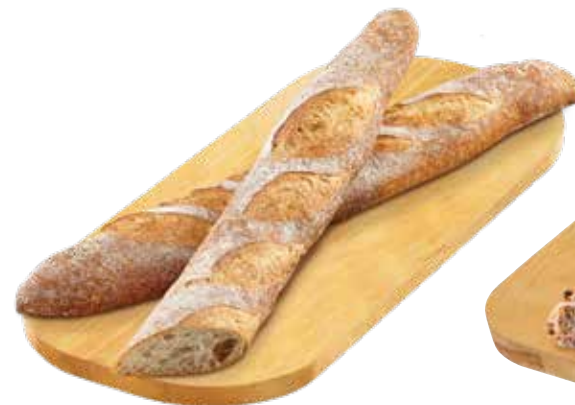
Front Street Bakery Calabrese Baguette 325 G