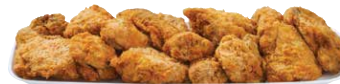
Fried Chicken Serves 12