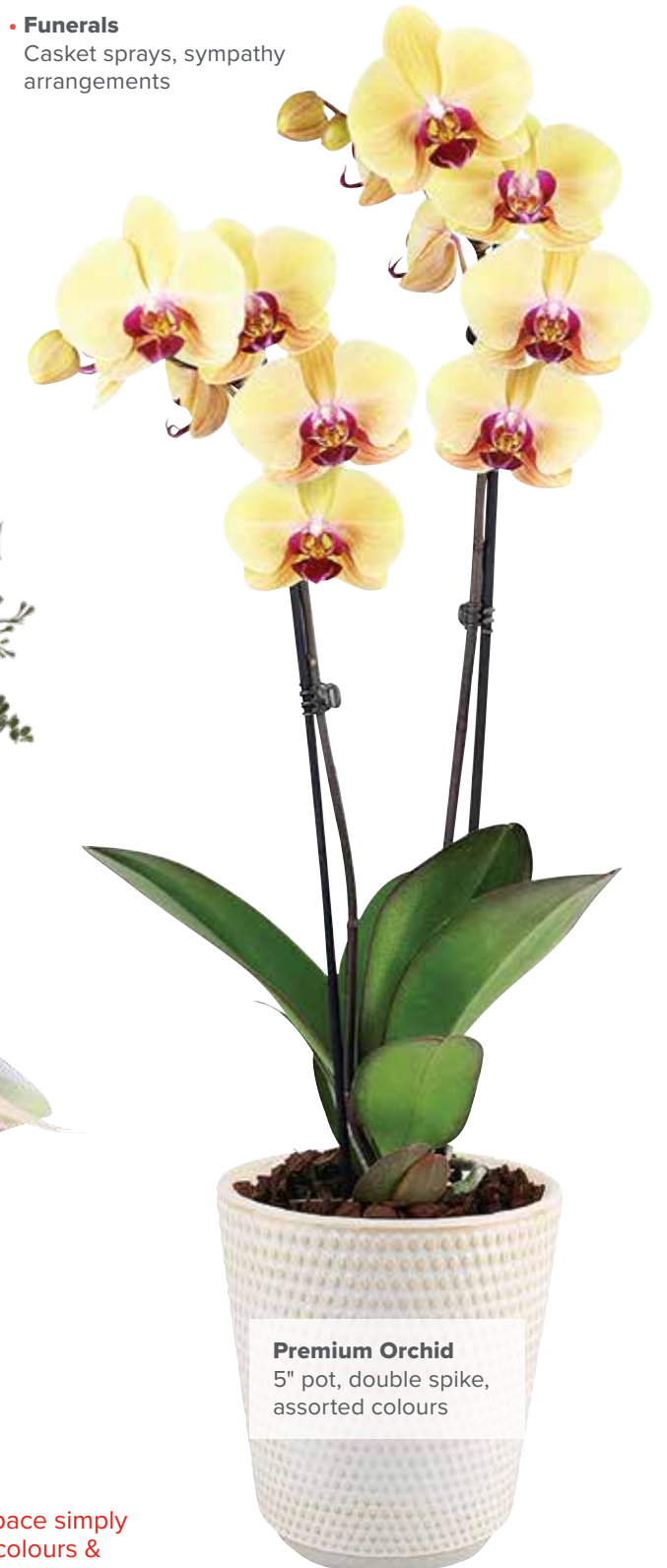
Premium Orchid 5" pot, double spike, assorted colours