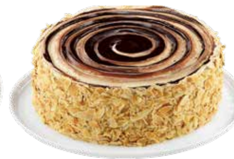
Jamocha Almond Cake Serves 10-12 | 8"