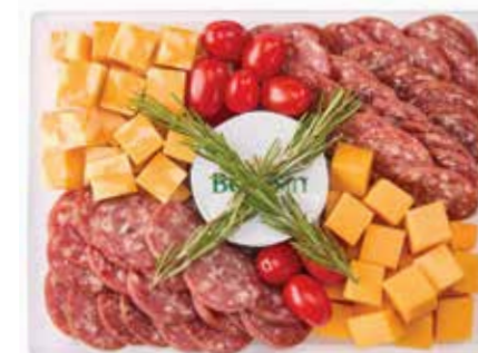
Salami & Cheese Tray Serves 2-4