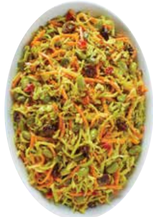
Supercrunch Salad Serves 6-8