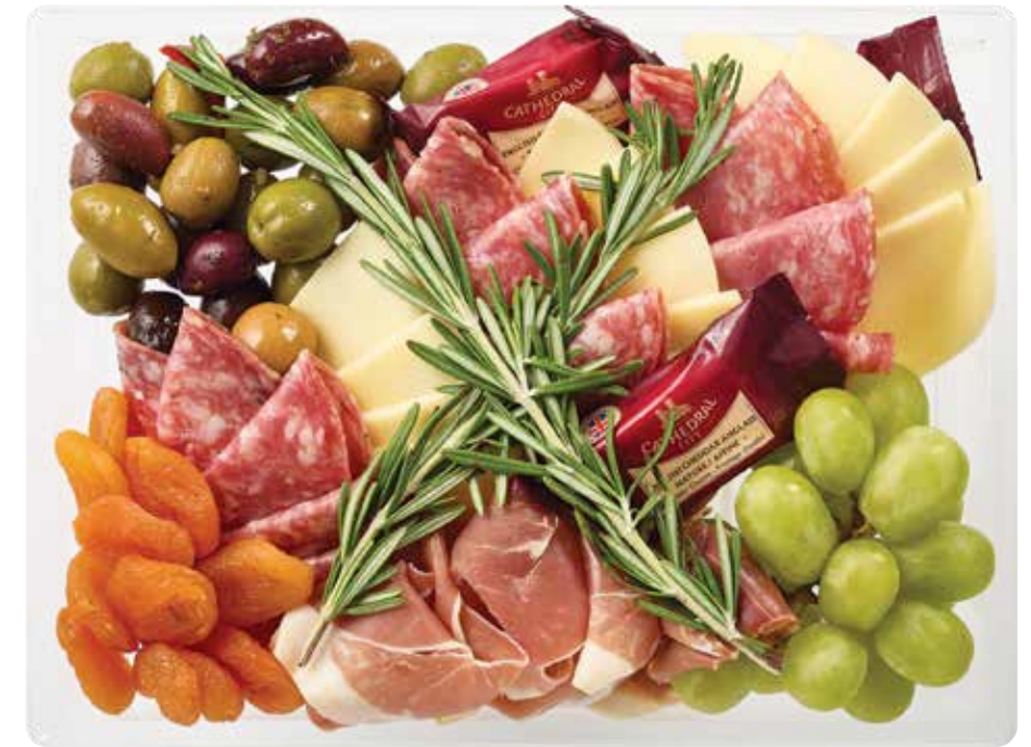
Taste of Italy Charcuterie Tray Serves 2-4