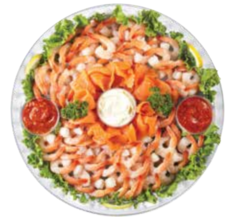
Ultimate Seafood Platter Serves 12

For more elegant events, like anniversaries & engagements, creating a fresh sushi & seafood table adds sophistication. Choose from a wide variety of seafaring sensations, including salmon avocado, spicy tuna & California & tiger rolls + Alaskan sea legs, crab legs, assorted shrimp & more.