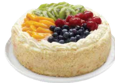
Fancy Fruit Topped Shortcake Serves 10-12 | 8"

Can't decide? Mix and match the perfect slices to delight your guests.