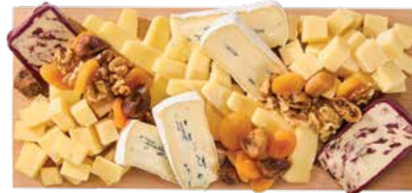
Around the World Cheese Board Serves 8-10