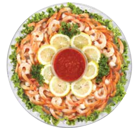
South Pacific Platter Serves 15