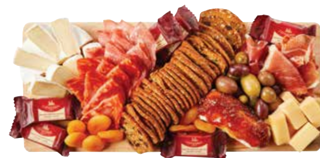
Artisan Charcuterie Board Serves 8-10