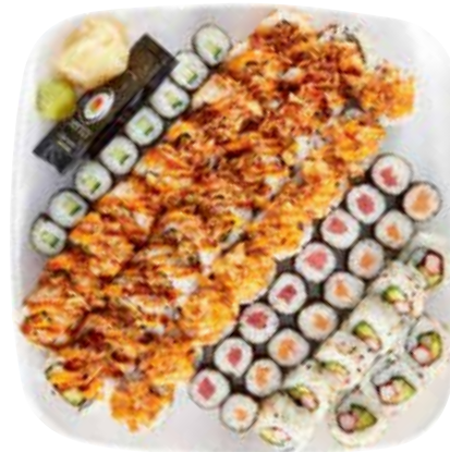
Utage Platter 51 Pieces | Serves 6