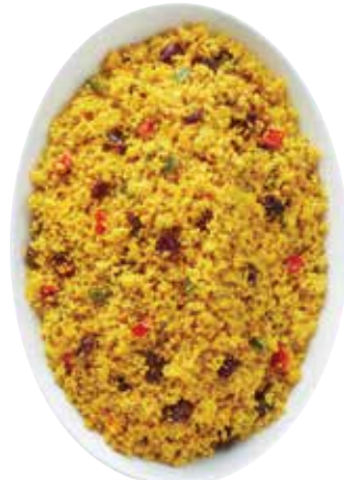
Cranberry Couscous Salad Serves 6-8