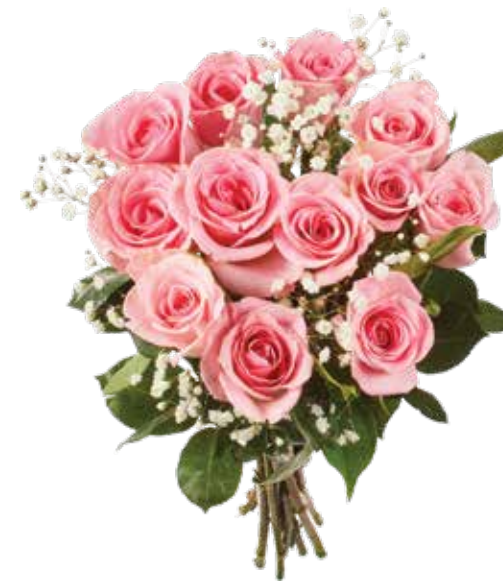
Premium Dozen Roses 12 stems, assorted colours