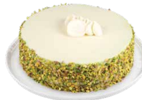
Pistachio Cake Serves 10-12 | 8"