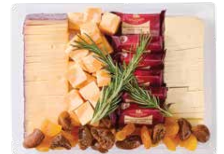
Firm & Fabulous Charcuterie Tray Serves 2-4