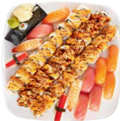
Matsuri Platter 39 Pieces | Serves 6