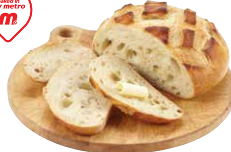
Front Street Bakery San Francisco Style Sourdough Bread 500 G