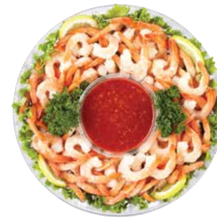
Tropical Delight Platter Serves 10