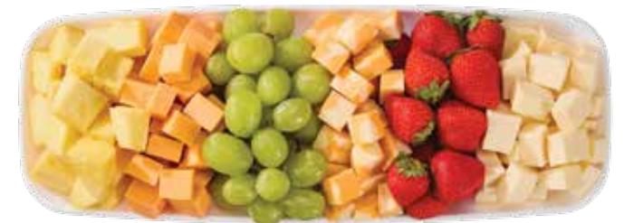
Fruit & Cheese Platter Serves 12