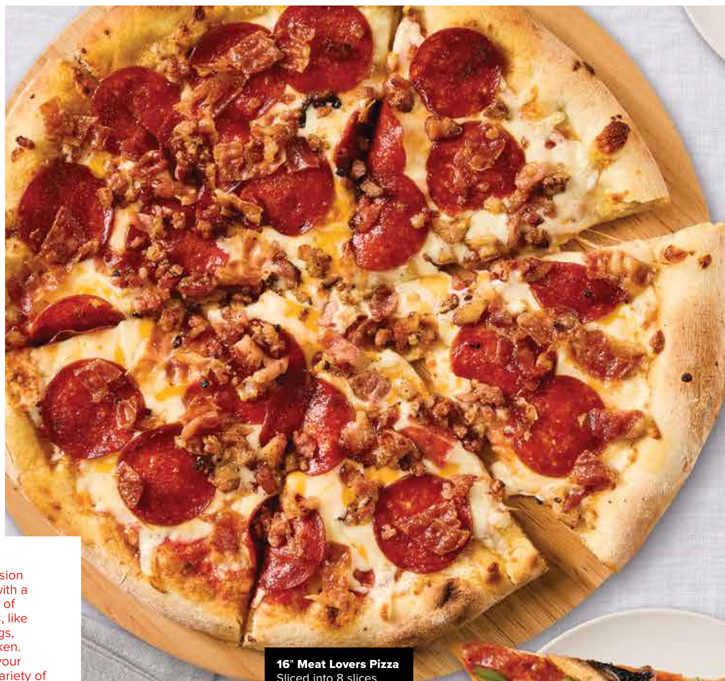
16" Meat Lovers Pizza Sliced into 8 slices