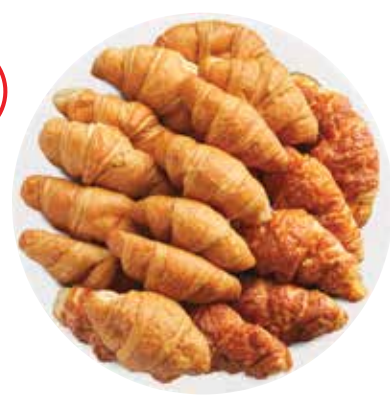
Front Street Bakery All Butter Croissant Platter 18 Pieces