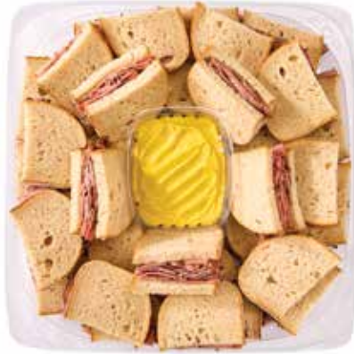
Montreal Stacked Platter Serves 12

Make your wraps the way you want – Choose any 4 of these tasty varieties: • Chickpea • Quinoa & Kale • Tuna Salad • Egg Salad • Chicken Salad • Salmon Salad • Roast Beef • Black Forest • Turkey