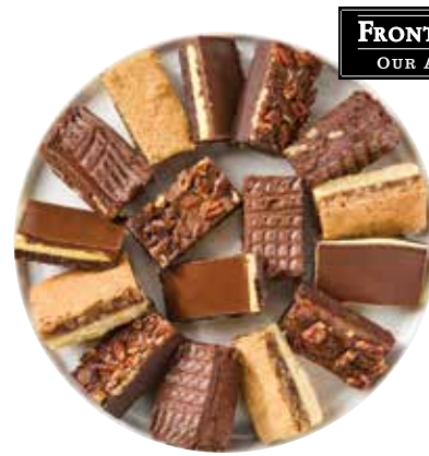
Front Street Bakery Assorted Party Squares Platter 16 Pieces