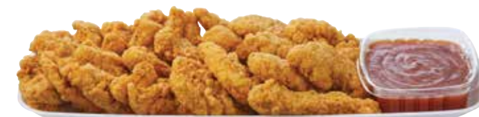
Chicken Thighs Serves 12