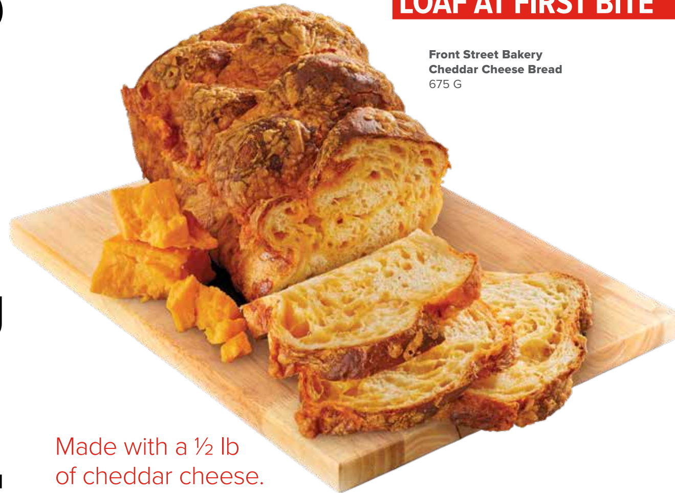
Front Street Bakery Cheddar Cheese Bread 675 G