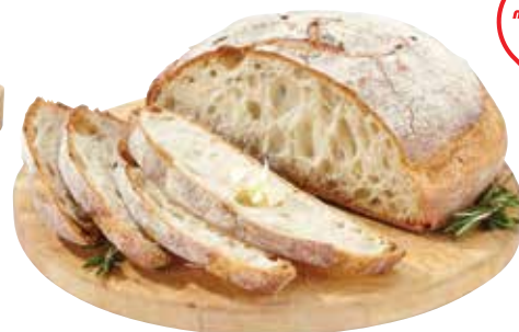
Front Street Bakery Calabrese Bread 500 G