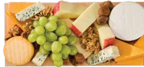
The Fromage Collection Board Serves 12

M ake casual social gatherings memorable with fresh deli & cheese platters. Choose from delectable mixes of soft & hard cheeses, cured deli meats, savoury crackers, crunchy breads & breadsticks + fresh fruits & veggies. Pair with hot honey, mustard & assorted jams.