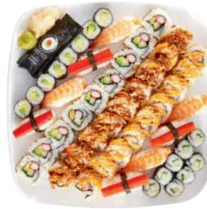
Atsumari Platter 51 Pieces | Serves 6