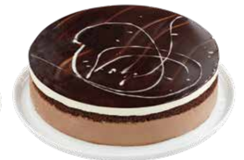
Double Chocolate Mousse Serves 10-12 | 8"