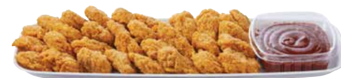
Chicken Bites Serves 12