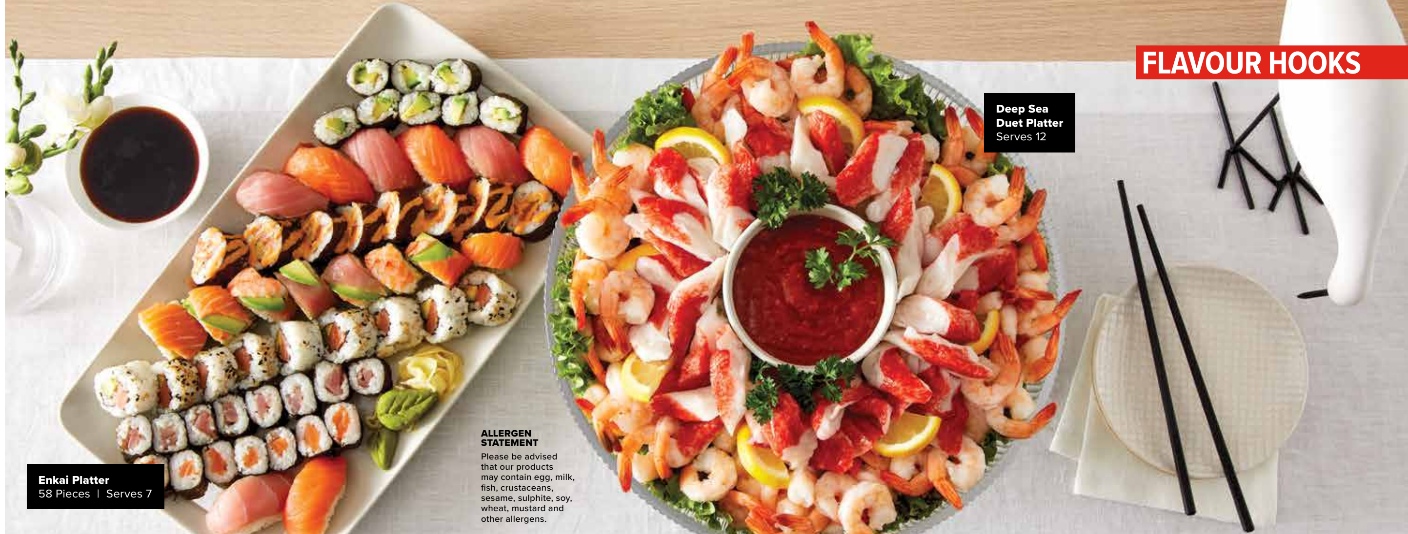
Enkai Platter 58 Pieces | Serves 7