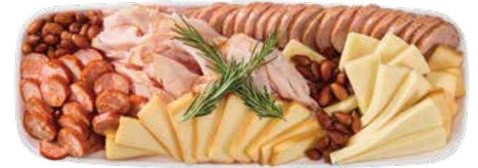
Smokehouse Platter Serves 12