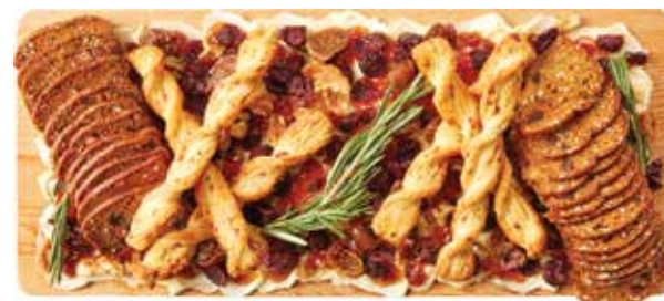
Fruit & Nut Butter Board Serves 6