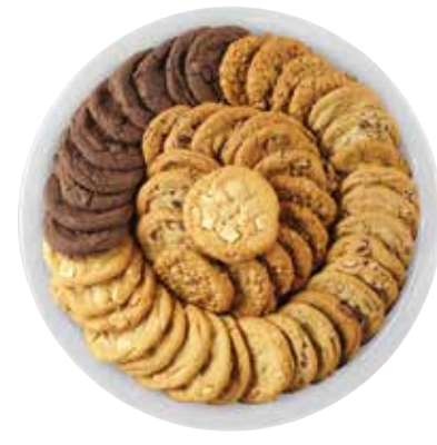
Front Street Bakery Gourmet Cookie Platter 52 Pieces