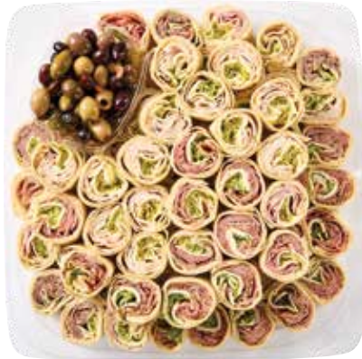
Pinwheel Platter Serves 12