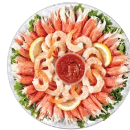
Alaskan Sea Legs & Shrimp Platter Serves 12