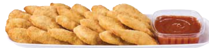
Chicken Tenders Serves 12