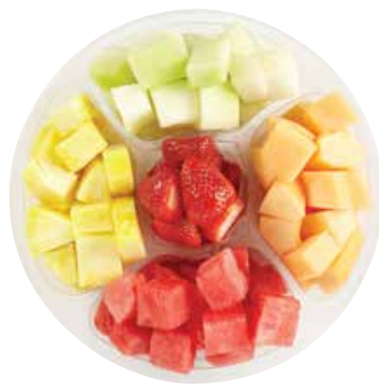
Fresh Cut Fruit Carousel Serves 6-8