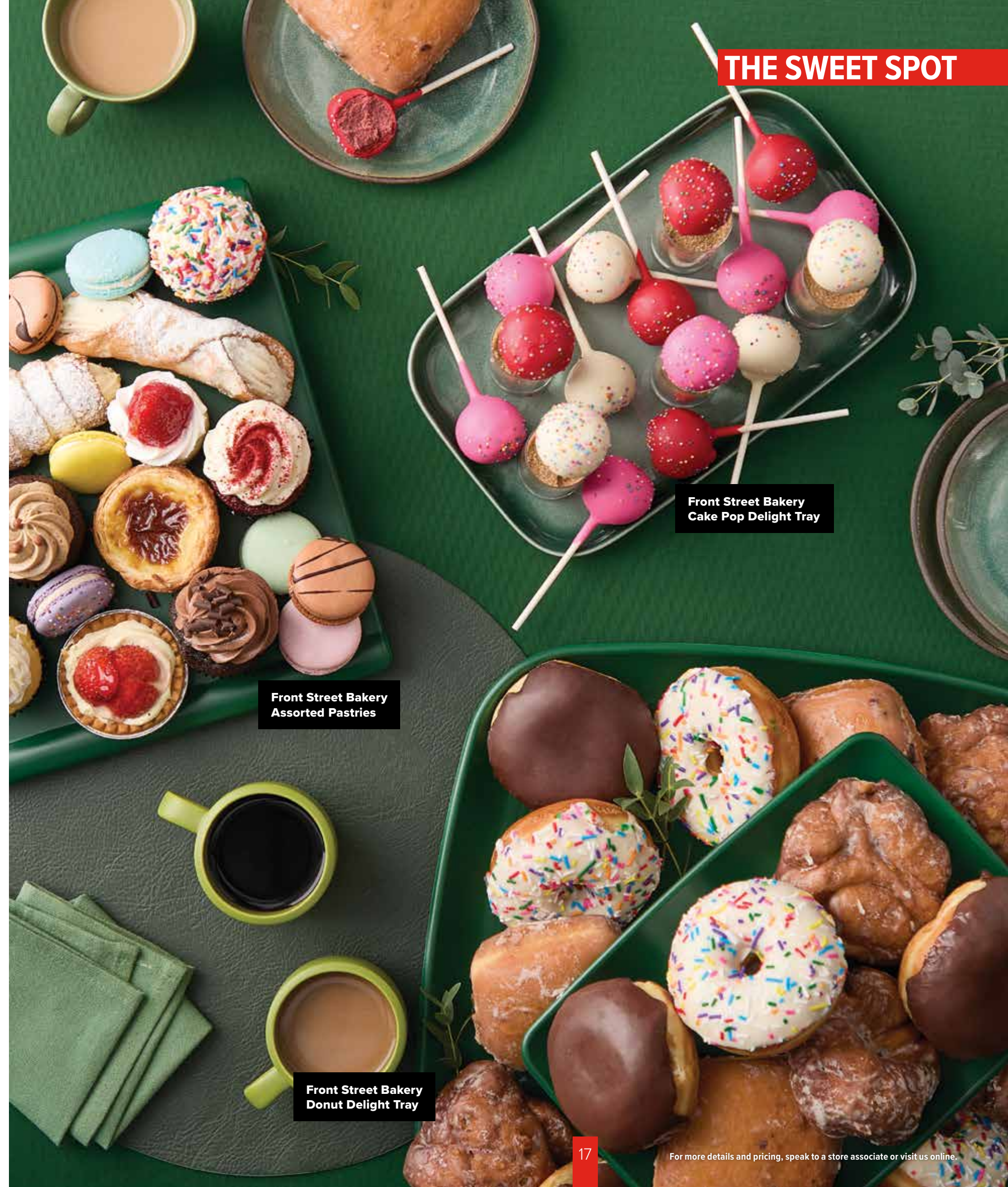
Front Street Bakery Cake Pop Delight Tray