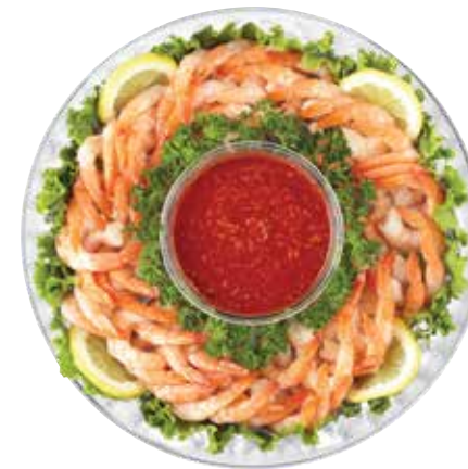
Paradise Island Platter Serves 5