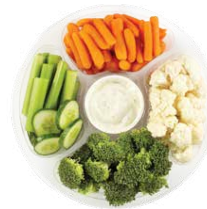
Fresh Cut Vegetable Carousel Serves 6-8