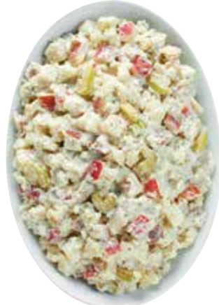
Pickle Potato Salad Serves 6-8