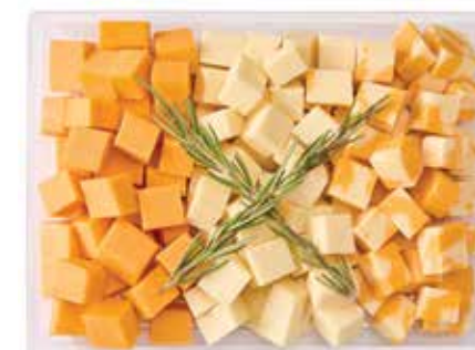
Mini Cube Cheese Tray Serves 2-4