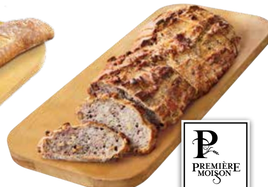
Première Moisson Sourdough Walnut Bread 500 G