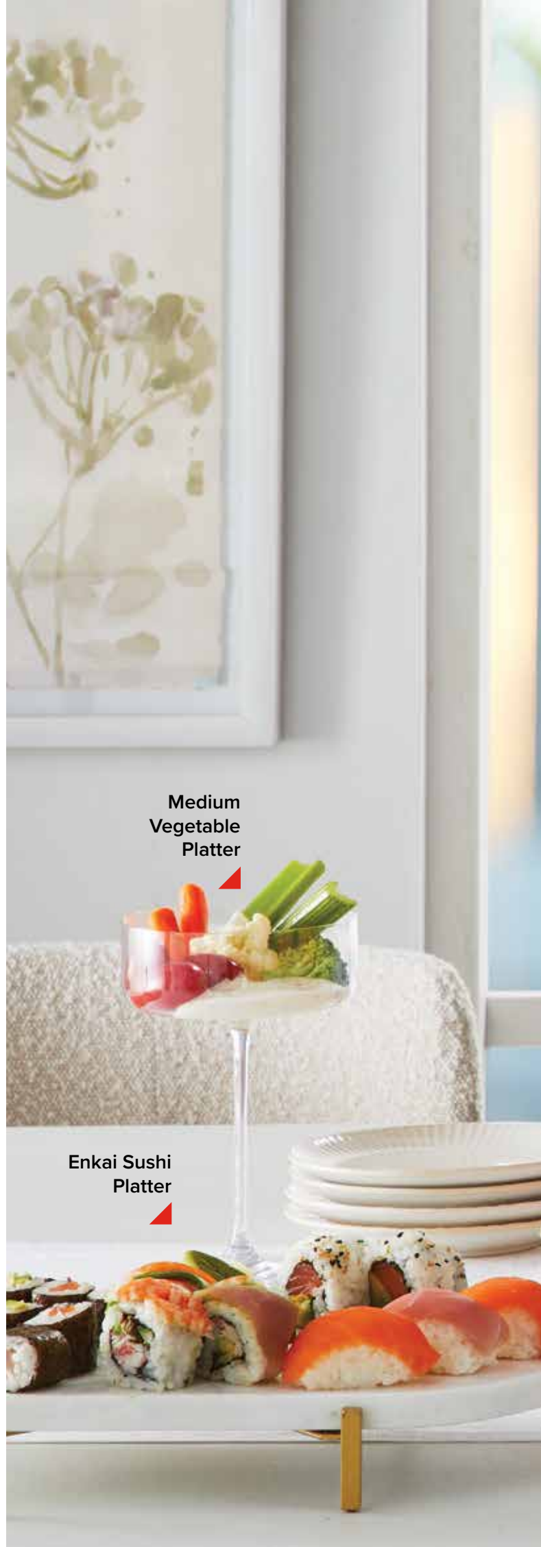
Medium Vegetable Platter

Items may not be exactly as shown. Prices are subject to change. Products may contain or may have come in contact with food allergens. If you have any questions or concerns, please ask for assistance.