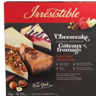
Irresistible Cheesecake 12 Pieces

E legant or casual, desserts & baked goods are a must at any event. Impress your guests with a variety of flavours & textures, from chocolatey & fruity to creamy & crispy. Add delightful accompaniments to your treat table with small bowls of chocolate ganache, caramel sauce or fruit compote.