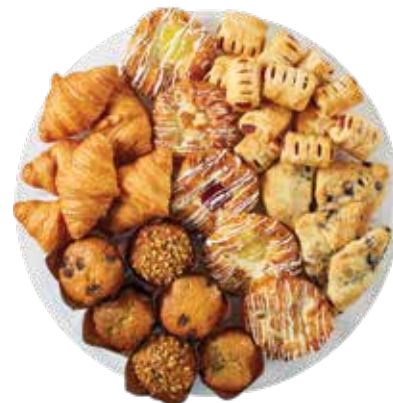
Front Street Bakery Breakfast Platter 33 Pieces