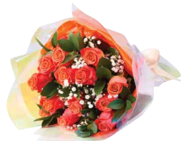
Presentation Bouquets Assorted colours, sizes and styles