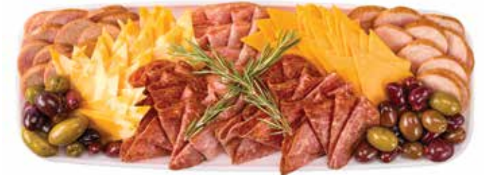
Snack Delight Platter Serves 12