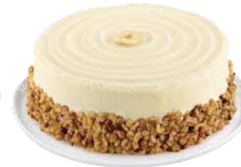
Banana Cake with Cream Cheese Icing Serves 10-12 | 8"