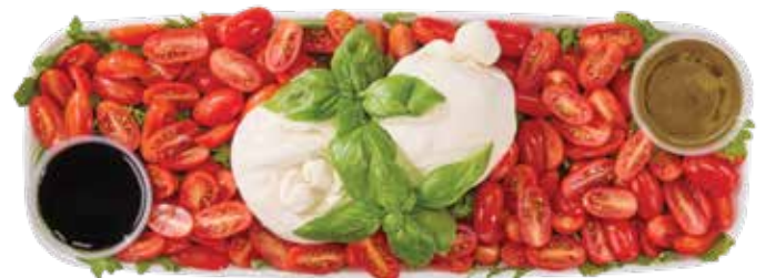
Burrata Platter Serves 12