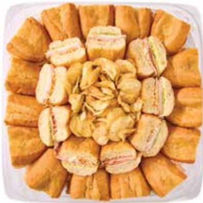
Sub 2 Go Kettle Chip Platter Serves 12