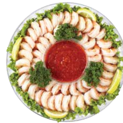
Top Deck Platter Serves 10