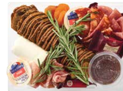
Cured & Crafted Charcuterie Tray Serves 2-4