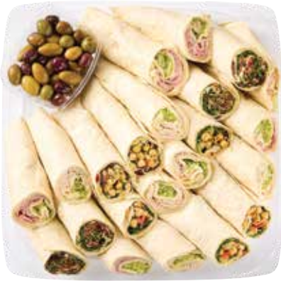
Wrap Delight Platter Serves 12

Make your wraps the way you want – Choose any 4 of these tasty varieties: • Chickpea • Quinoa & Kale • Tuna Salad • Egg Salad • Chicken Salad • Salmon Salad • Roast Beef • Black Forest • Turkey