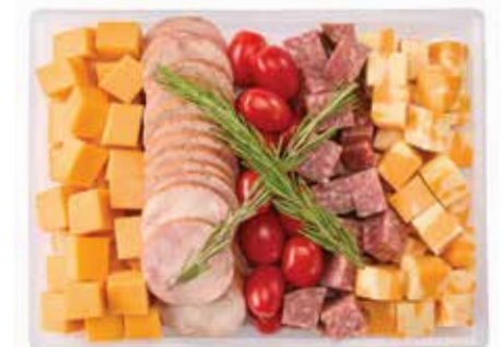
Kobassa & Cheese Tray Serves 2-4