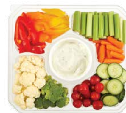
Medium Vegetable Platter Serves 10-15