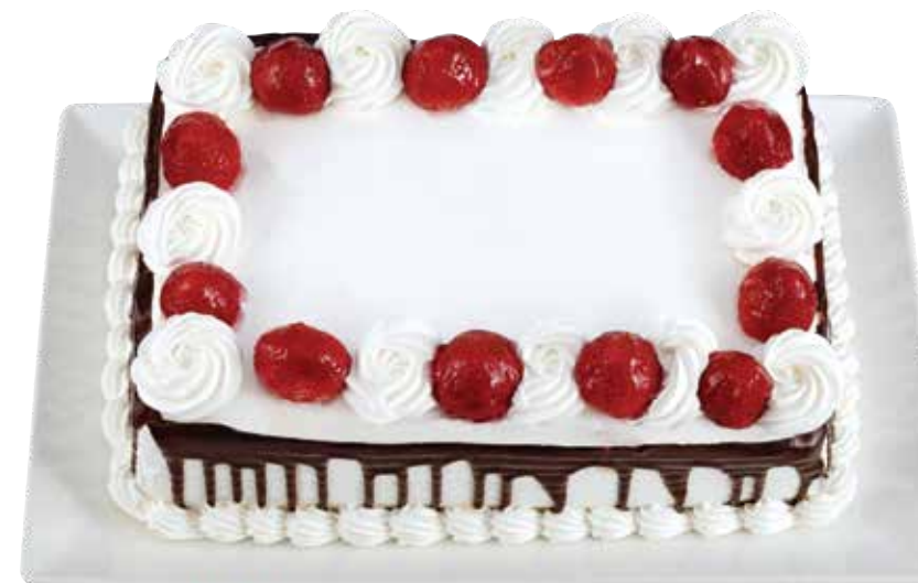
Special Occasion Cakes Choose From ¼ Slab Serves 15-20, ½ Slab Serves 30-40, Full Slab Serves 70-90

Celebrate everything with our decadent cakes, cupcakes and other sweet treats.