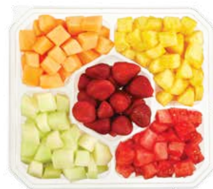
Medium Fruit Platter Serves 10-15