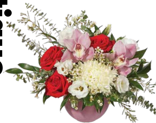
Custom-Made Arrangements Assorted colours, sizes and styles