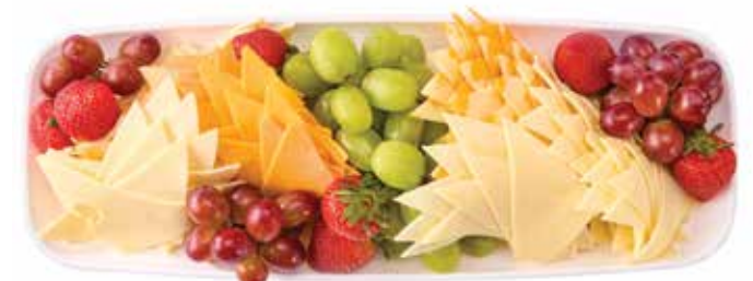
Cheese Sensation Platter Serves 12