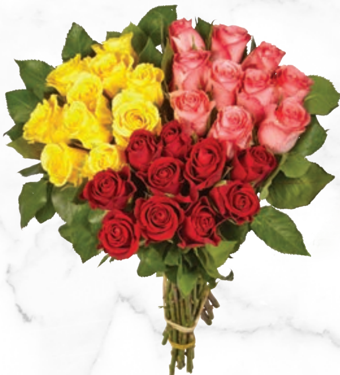
▲ INTERMEDIATE ROSES, FS2 10 Stems, Assorted Colours