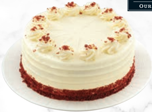
▲ FRONT STREET BAKERY RED VELVET CAKE 8", 1.45 kg, SC1

FRONT STREET BAKERY OUR ABSOLUTE FINEST™