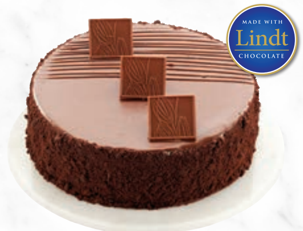
▲ SWISS MILK CHOCOLATE CAKE MADE WITH LINDT 8", 1.3 kg, SC6

Rich milk chocolate cake and smooth dark chocolate truffle with a layer of decadent Lindt dark chocolate ganache