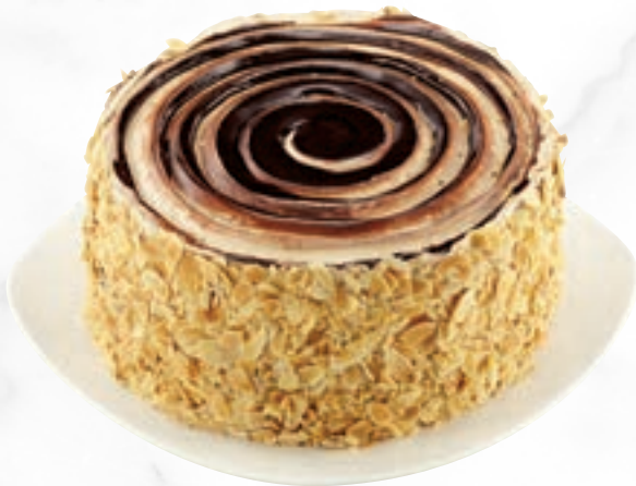
▲ FRONT STREET BAKERY JAMOCHA ALMOND CAKE 8", 1.25 kg, SC4

Made with 35% cream, the perfect combination between vanilla and chocolate mousse. Topped with fresh berries