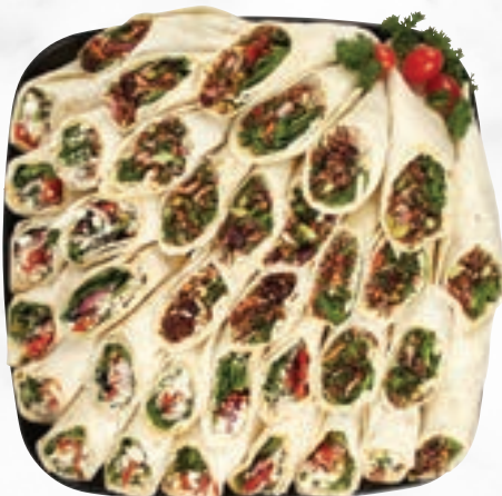
◀ VEGGIE WRAP PLATTER SERVES 10, $5

A Must Have for Any Party An Assortment of Sandwiches - Egg Salad, Salmon Salad, Tuna Salad and ending with Turkey Bacon. Available on white or whole wheat