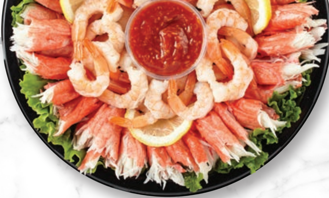
◀ ALASKAN SNOW LEGS & SHRIMP PLATTER SERVES 12, ST8

A Real Crowd Pleaser One Pound of Alaskan Snow Legs, One Pound of Large Cooked White Pacific Shrimp, Irresistibles Seafood Sauce