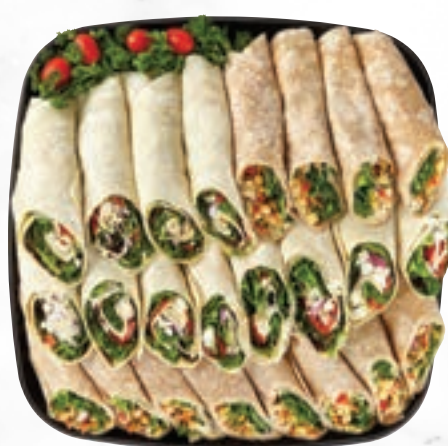
◀ DELUXE VEGETARIAN WRAP SERVES 10, $9

For the Vegetarian Premium Flour Tortillas, 2 Varieties of Vegetarian Wraps, Kale & Quinoa Blend with Hummus, Roasted Vegetables with Feta, carefully arranged and garnished