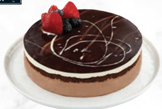
▲ FRONT STREET BAKERY DOUBLE CHOCOLATE MOUSSE CAKE 8", 875 g, SC2

Elegant, moist, ruby-red cake finished with smooth and silky cream cheese icing