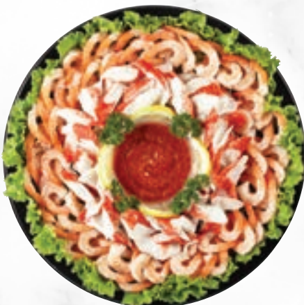
▲ DEEP SEA DUET PLATTER SERVES 12, ST5

Impress Your Guests 2 lbs of Extra Large Cooked Shrimp, Irresistibles Seafood Sauce