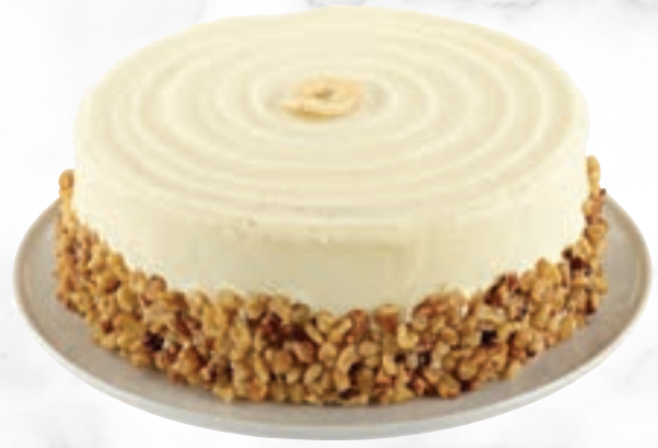
▲ FRONT STREET BAKERY BANANA CAKE WITH CREAM CHEESE ICING 8", 1.5 kg, SC3

Perfect combination of chocolate cake, almond meringue and chocolate fudge layered together to make this the ultimate dessert