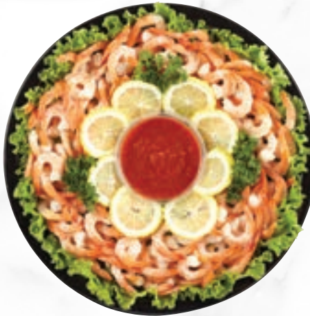
▲ SOUTH PACIFIC PLATTER SERVES 15, ST3

For all Parties, Large and Small Pacific White Shrimp, Irresistibles Seafood Sauce, Over 80 Shrimp