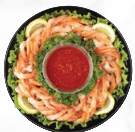
▲ PARADISE ISLAND PLATTER SERVES 5, ST1

Something for Everyone Large Shrimp, Premium Atlantic Smoked Salmon, Cream Cheese, Capers, Irresistibles Seafood Sauce