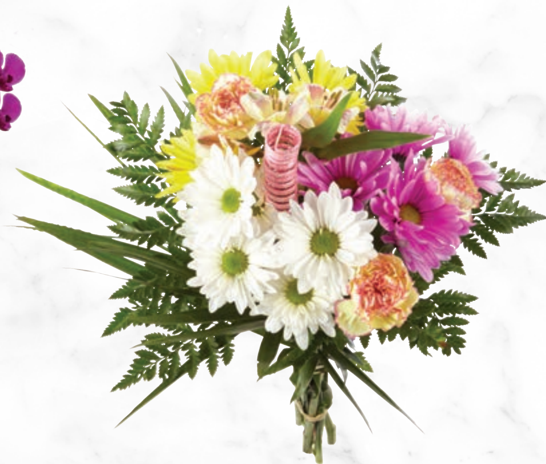
▲ MIXED BOUQUET, FS4 Guaranteed to Last 10 Days, Assorted Varieties