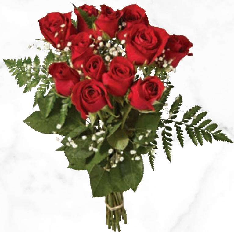
▲ PREMIUM DOZEN ROSES, FS1 12 Stems, Assorted Colours