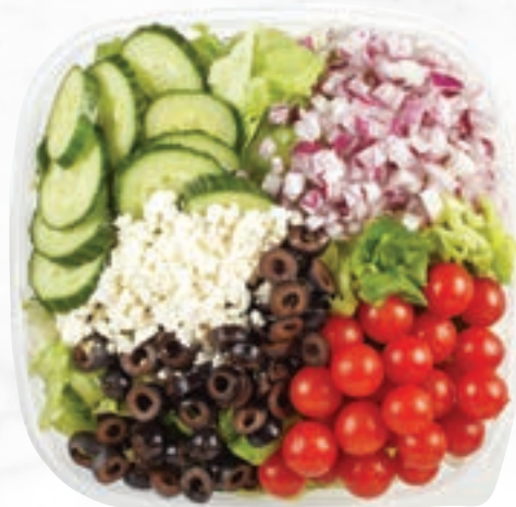
▲ FAMILY SIZE SALAD SERVES 3-5, VT3F

Cauliflower Florets, Broccoli Florets, Baby Carrots, Celery Sticks, Cucumber, Includes Dip