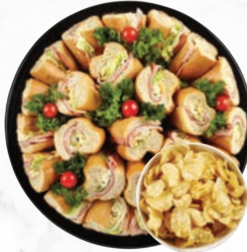
◀ SUB 2 GO WITH KETTLE CHIPS PLATTER SERVES 10, $2

Exclusive to Metro Premium Calabrese Baguette, Angus Lean Roast Beef/ Swiss, Oven Roasted Turkey/ Havarti/Tomato, Smoked Meat/ Swiss