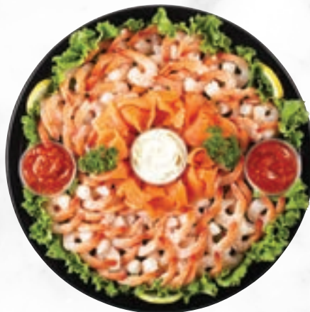
▲ ULTIMATE SEAFOOD PLATTER SERVES 12, ST6

A Perfect Pairing Pacific White Shrimp, Crab-style Seafood, Irresistibles Seafood Sauce