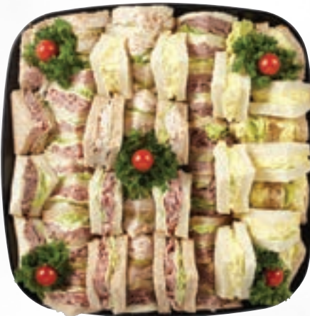
◀ THE DELUXE SANDWICH PLATTER SERVES 12, $3

A Game Day Favourite Freshly-baked Paninis, Variety Pack Meats Topped with Mozzarella Cheese and Shredded Lettuce and Kettle Chips