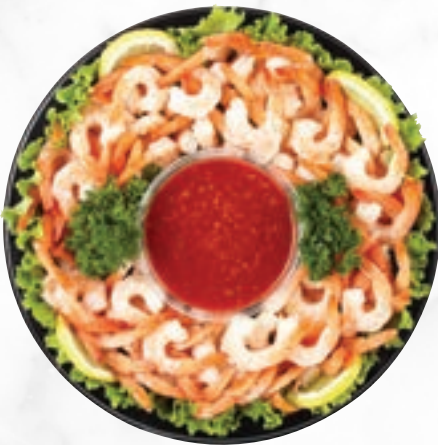
▲ TROPICAL DELIGHT PLATTER SERVES 10, ST2

A Real Crowd Pleaser One Pound of Alaskan Snow Legs, One Pound of Large Cooked White Pacific Shrimp, Irresistibles Seafood Sauce