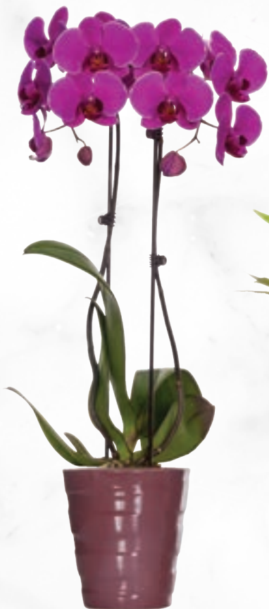
▲ PREMIUM ORCHID, FS3 5" Pot, Double Spike, Assorted Colours