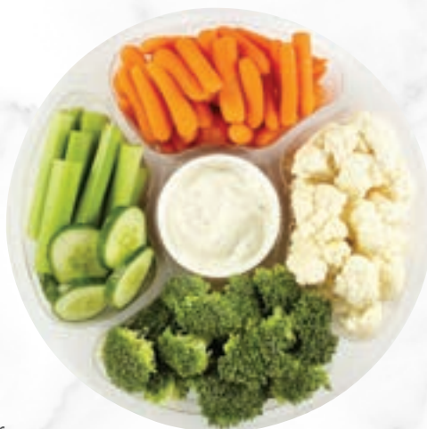
▶ FRESH CUT VEGETABLE CAROUSEL SERVES 6-8, VT2

Great for Entertaining Pumpernickel Bread, Spinach Dip