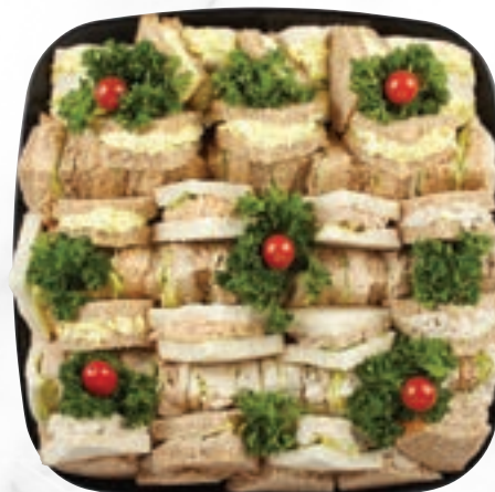
◀ FINGER SANDWICHES SERVES 12, $4

One of our Classics A Variety of Handmade Sandwiches, Roast Beef, Roasted Turkey Breast, Black Forest Ham, Egg Spread, Creamy Havarti. Available on White and Whole Wheat