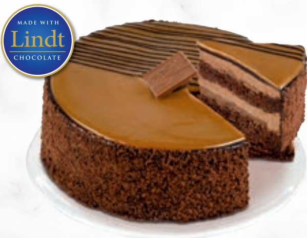
▲ FRONT STREET BAKERY SALTED CARAMEL CHOCOLATE CAKE MADE WITH LINDT 8", 1.3 kg, SC5

Moist layers of banana cake, delicately filled and iced in cream cheese icing