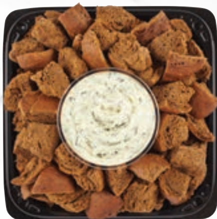
◀ PUMPERNICKEL TRAY WITH DIP SERVES 10, VT4

Great for Entertaining Pumpernickel Bread, Spinach Dip