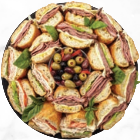
◀ URBAN MEAT CALABRESE BAGUETTE PLATTER SERVES 12, $7

Exclusive to Metro Premium Calabrese Baguette, Angus Lean Roast Beef/ Swiss, Oven Roasted Turkey/ Havarti/Tomato, Smoked Meat/ Swiss