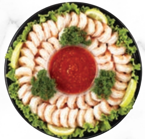
▲ TOP DECK PLATTER SERVES 10, ST4

For all Parties, Large and Small Pacific White Shrimp, Irresistibles Seafood Sauce, Over 120 Shrimp